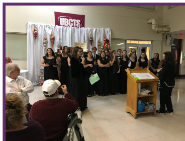
Palisades Madrigal Singers performed holiday music.