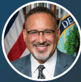
U.S. Department of Education Secretary Cardona

Featuring an introduction from Neera Tanden, Domestic Policy Advisor to the President