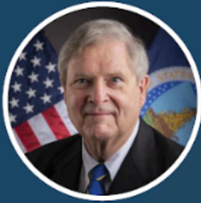
U.S. Department of Agriculture Secretary Vilsack